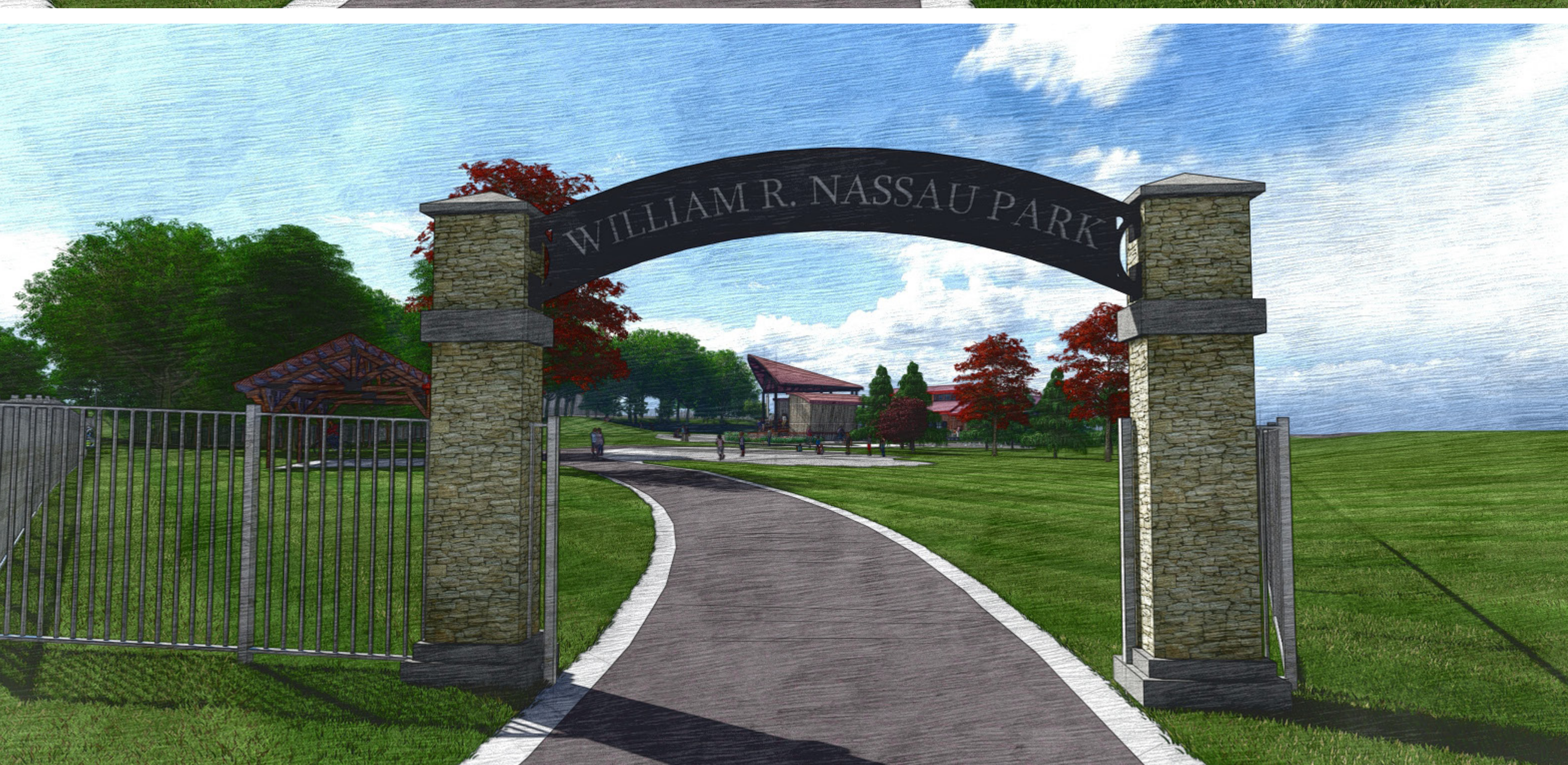
WILLIAM R. NASSAU PARK TOWN OF LOWELL, INDIANA JANUARY 23, 2023